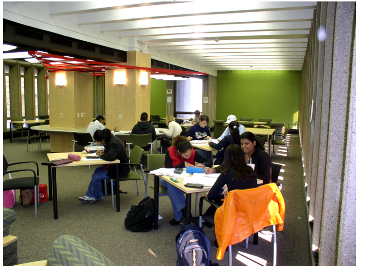
Math Learning Center in 430 SEO